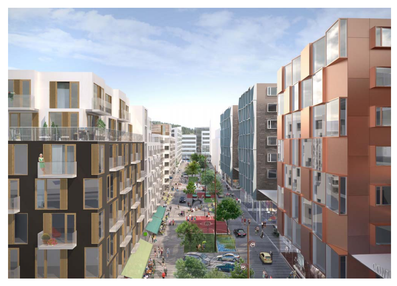
Sketch of the planned development in the Stora Frösunda property block at Haga Norra, Solna