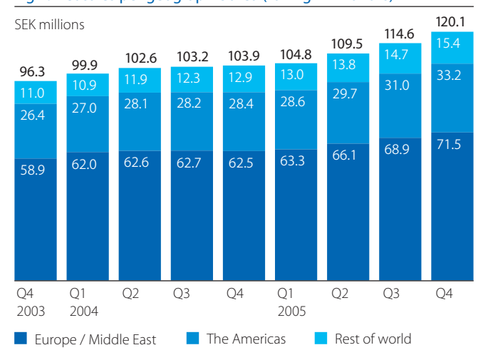
Fig 1. Net sales per geographic area (rolling 12 months)

As can be seen in Figure 2, Vitrolife's sales have historically been higher in the first quarter than in other quarters. This is due to the fact that shipments have been made to the fertility clinics every fourth week and there have been four shipments during