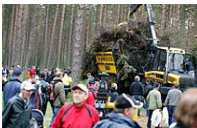
SkogsElmia will bring together forest owners, contractors, forest officials and suppliers of machinery and services for forestry for a few intensive days.