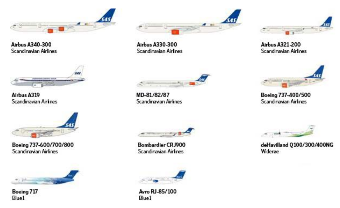
For further information on each model of aircraft, refer to www.sasgroup.net